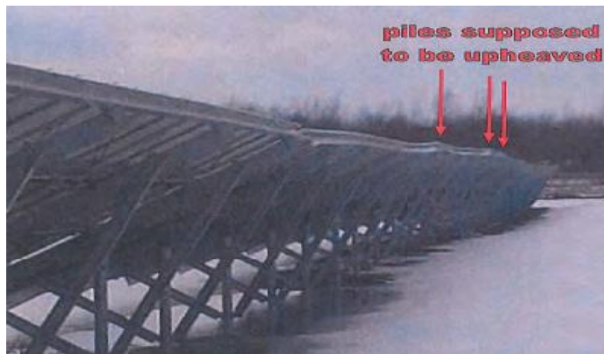
Figure 3. Piles affected by frost showing deformation of the racking