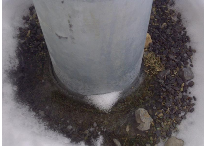
Figure 2. A pile moving out due to frost. The movement can be observed at the base of the pile

heave will not create much of issues for the facility. Usually a number of piles in each row will experience pile heave while others will not be affected. The piles experiencing heave are usually observed to experience different values of uplift which are rarely uniform as can be seen in Figure 3. The generally acceptable limits of pile heaving are 36mm of differential heaving based on IEC 61646 (Thin-film terrestrial photovoltaic (PV) Modules – “Design qualification and type approval”) since beyond these limits, excess torsional stresses are induced in the solar panels along with additional flexural stresses induced in the racking beams possibly causing structural damage in addition to the connecting wires and connections getting into failure/breakage due to induced tension.