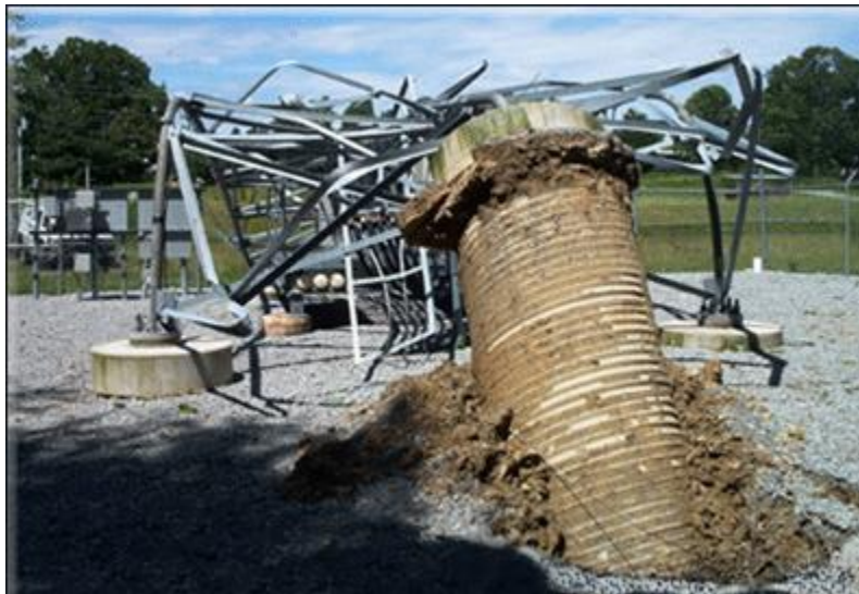
Figure 1. Tower foundation failing under effects of uplift and frost

Because of skin friction, and because unfrozen ground below the piles squeezes into the void left as the pile rises, the base of the pile does not return to its original position in summer [4].