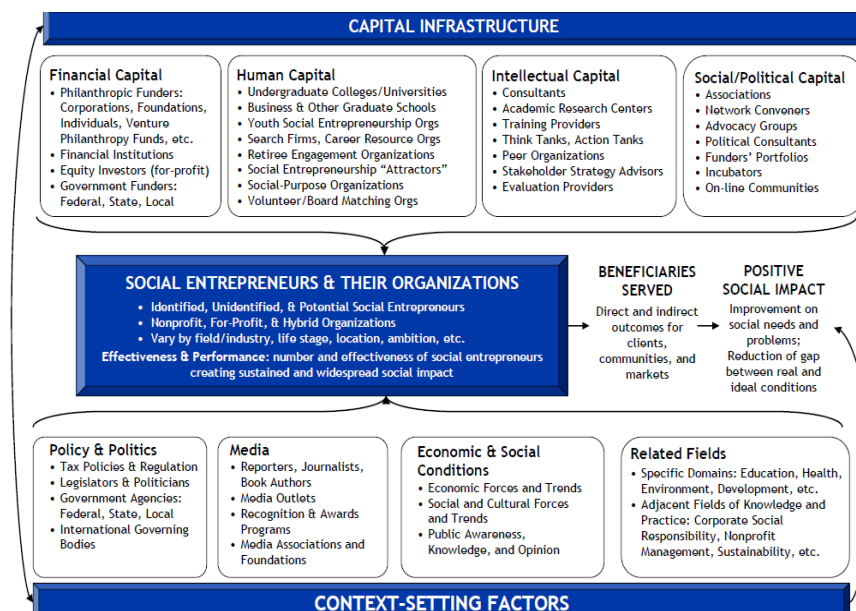
“Developing the field of social entrepreneurship” – June 2008 2